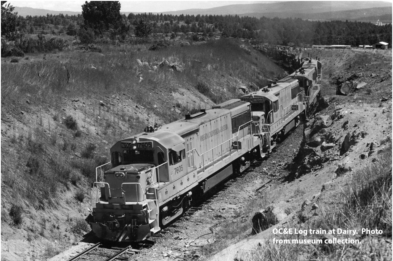
OC&E Log train at Dairy.

and was happy how I was able to recreate the past. Unfortunately I didn't realize how much of the past I actually captured. Only on the OC&E!