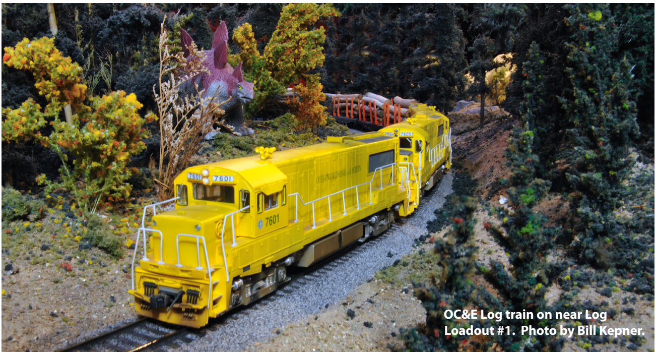
OC&E Log train on near Log Loadout #1.