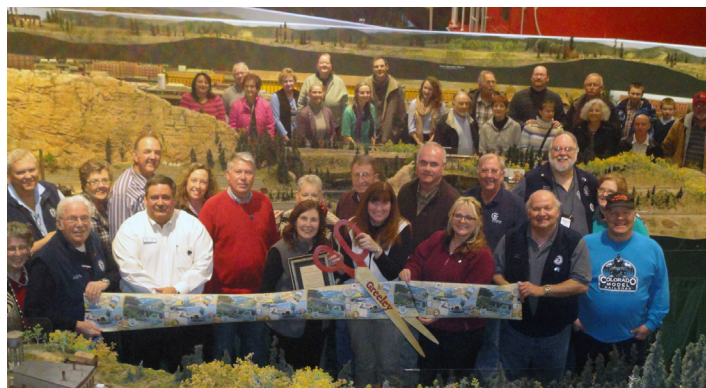
Volunteers and visitors, March 2014