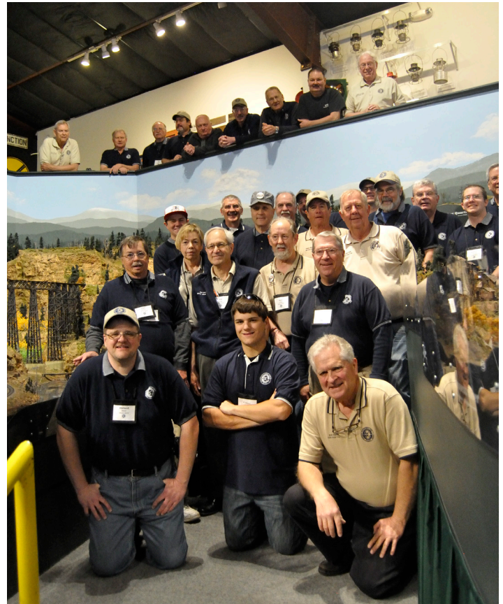
Volunteers, photo from April 2012