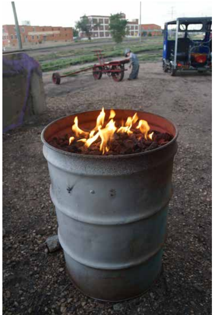
Museum volunteer Kyle Kempema created the burning fire barrels for the event.