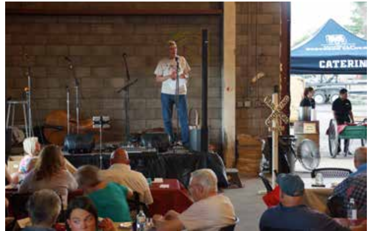
Museum board president starts to address the guests at this point a fierce storm blew into town; forcing the closure of the door to his left and making it much darker inside.