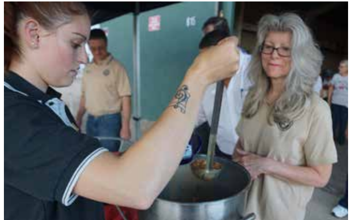
Below left: Even though the South Building's previous purpose in life was newspaper storage, it still makes a nice meeting facility. Below right: