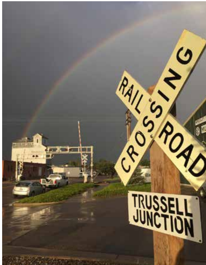
A rainbow caps off a great evening of celebration at the first annual Hobo Stew celebration.