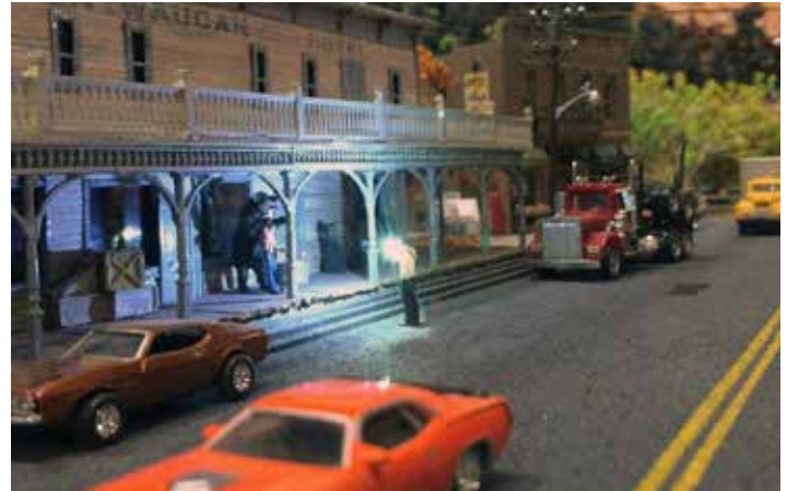
The tourists have found Sycan, so the hotel has set up a special attraction; you'll have to come see it for yourself!