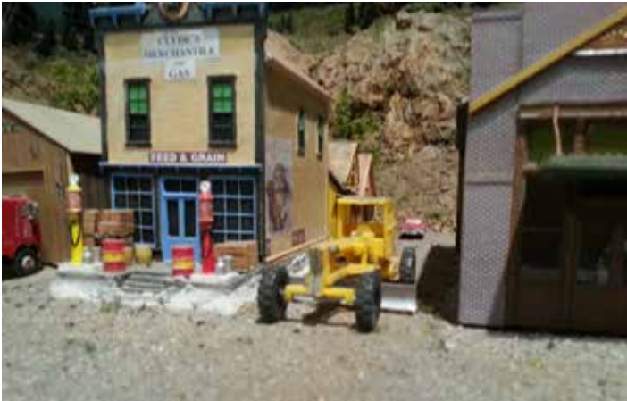
A building Contractor at Dairy is using a road grader to prepare the site for a new building.

The OC&E Model Railroad is always changing. Some of the new scenes on the layout include the following: