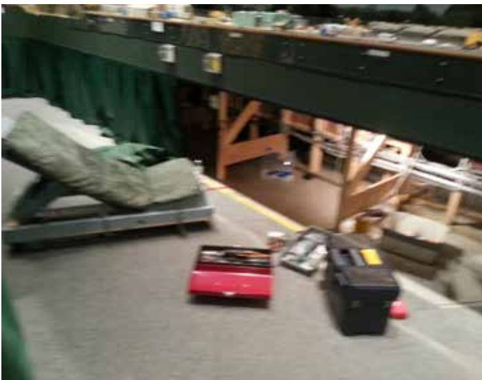
Where did Darrel go? The residents of west Lakeview have been complaining that the gates on the busy street don't work right. The railroad dispatched its expert signal maintainer to address the problems.