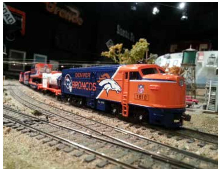
And with the Broncos in the playoffs this year, the OC&E hosted the Broncos special train. Like the Colorado Model Railroad Museum, this year's team showed that careful planning and execution showed the world how good they were.